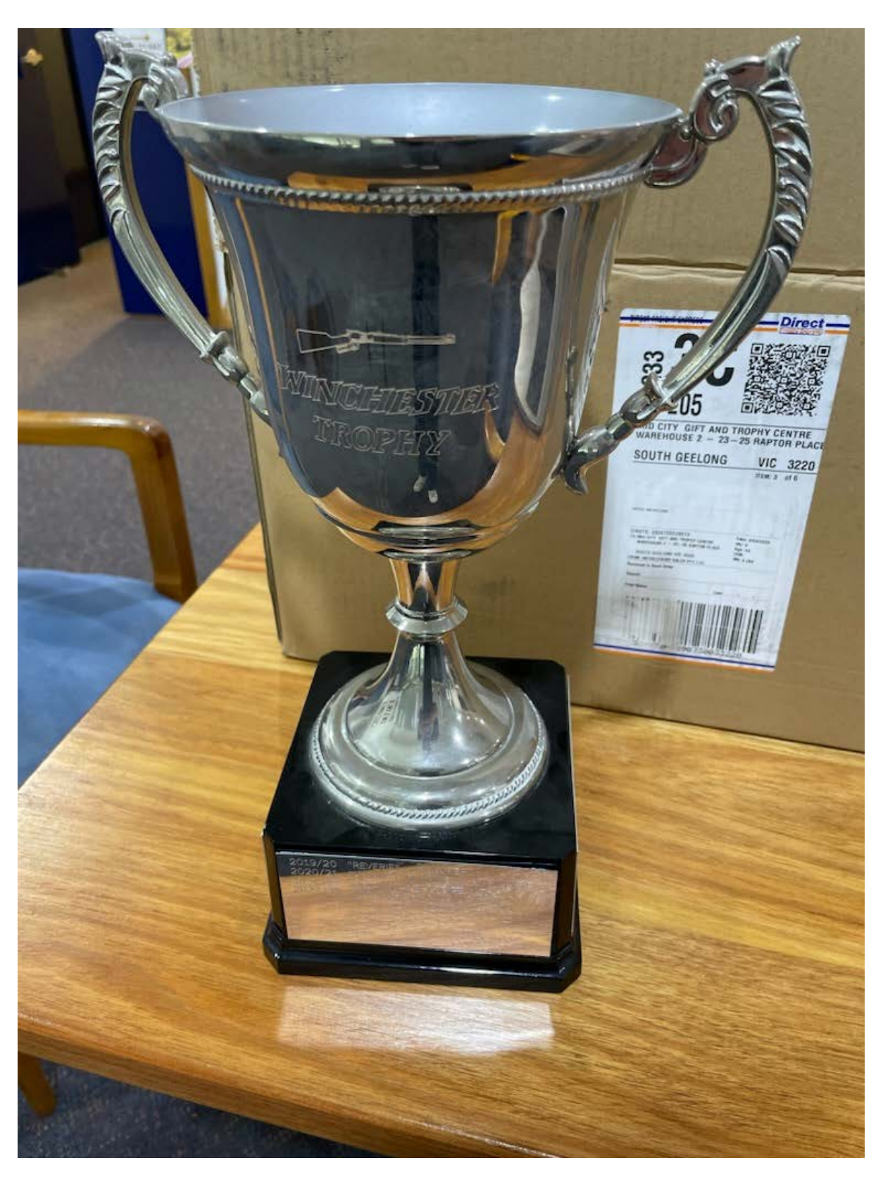
Winchester Trophy (Mk 2)